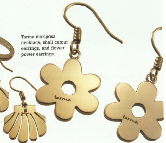
Tarma mariposa necklace, shell cutout earrings, and flower power earrings.

Named after a quaint Peruvian town at the foot of the Andes, Tarma creates jewelry out of recycled stainless steel that "celebrate the spirit of adventure and a love of the outdoors." Tarma supports equitable commerce, social diversity and sustainable environmental practices. Check out their new Mountain and Appalachian Trail series, which benefits the Appalachian Trail Conservancy.