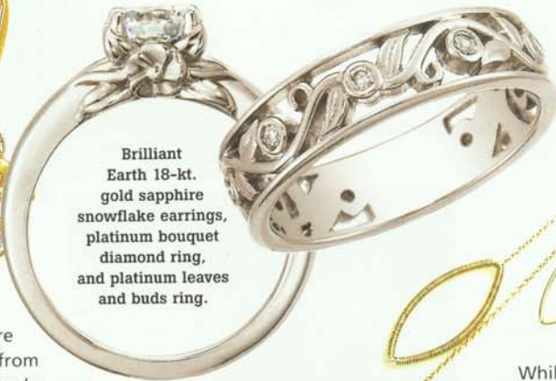
Brilliant Earth 18-kt. gold sapphire snowflake earrings, platinum bouquet diamond ring, and platinum leaves and buds ring.